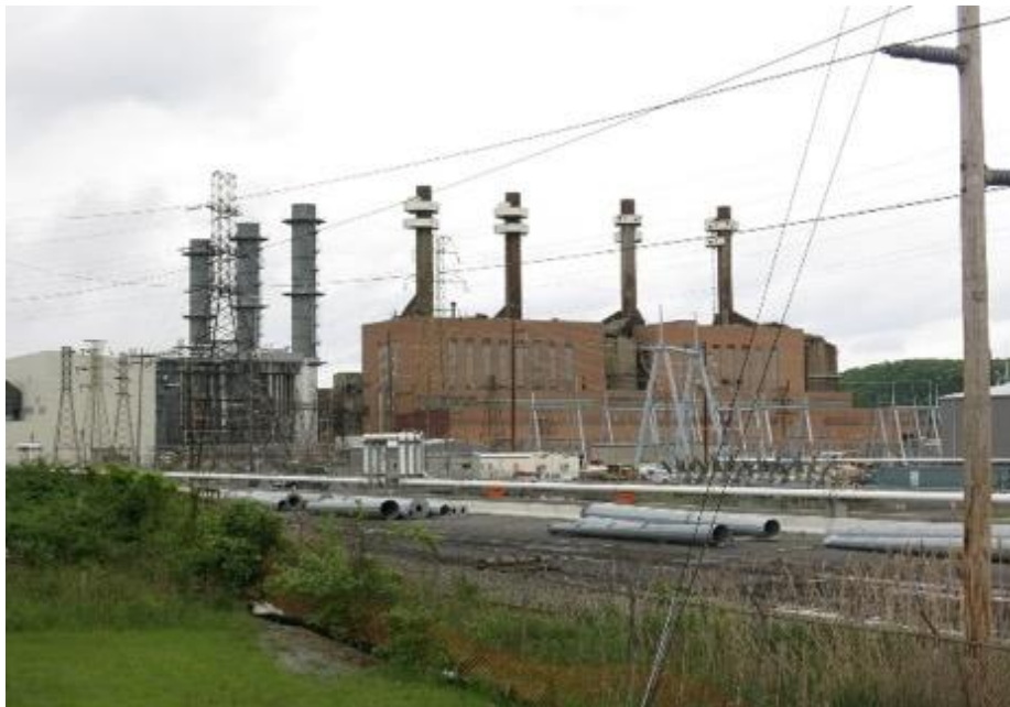
Figure 2 Shamokin Dam, PA, coal plant was closed in 2014, and the site still holds the infrastructure intact. (Source: NPR)

The reason so many coal plants remain structurally intact post-retirement relates to the costs associated with cleaning up accumulated toxic coal ash and waste. Developers are rarely willing to take on that risk (as described in Section 3.4). Because of costs associated with decommissioning and the lack of regulation putting the burden on plant owners to do so, remediation and redevelopment futures are either nonexistent or uncertain for many coal plants across the country. In response to this, many states and localities have developed task forces, like the Lansing Town Council described in Section 3.4, to remedy how to move forward with abandoned plants, but many do not have the funds to remediate and redevelop the sites. 4