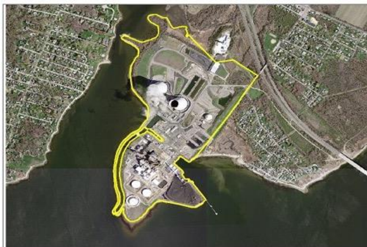
Figure 3 The Brayton Point coal plant site (50 miles from Boston, Massachusetts) is an ideal location for redevelopment, given its access to I-95, proximity to a planned offshore wind farm, and 2,000 MW of transmission capabilities.

Remediation efforts on Brayton Point to date have entailed asbestos and waste abatement, demolition of the cooling towers, crushing of onsite concrete, recycling of metal demolition debris, and site re-grading. Because of the site's proximity to a planned offshore wind farm 35 miles away, Anbaric Development Partners has announced its intention to build the Anbaric Renewable Energy Center, a logistics hub with a 1,200 MW high-voltage direct current converter and 400 MW of battery storage. The project hopes to maximize the potential of Massachusetts' offshore wind energy resource. 3