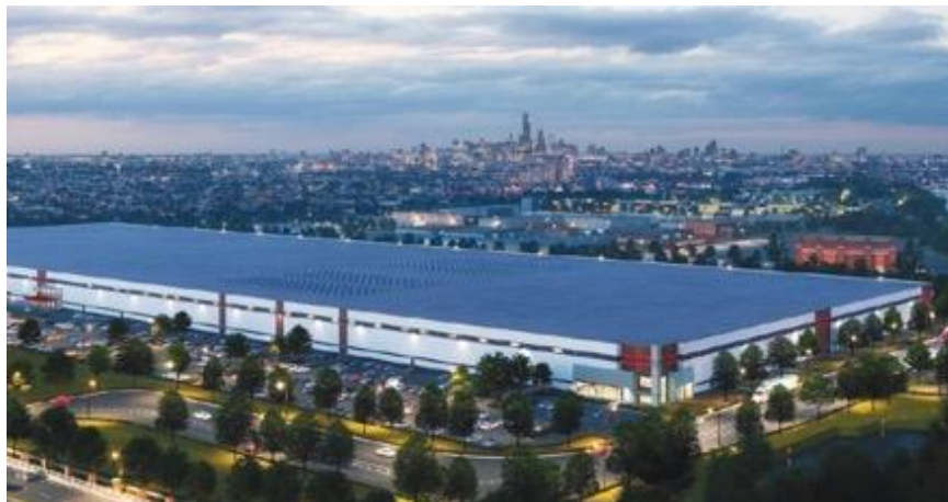
Figure 4 Named “Exchange 55,” a distribution center offers a Leadership in Energy and Environmental Design-certified warehouse building, over 1,000 jobs for the surrounding community, and accommodation of rooftop solar panels, electric vehicle charging infrastructure, and green landscaping.

An example of this is the $100 million-plus project taken on by Hilco Redevelopment on the Crawford Power Generating Station outside of Chicago, Illinois. 1 Shuttered in 2012, the facility, located along Interstate 55 and the Ship Canal, was demolished and replaced with 1 million square feet of warehouse space (Figure 4). 2